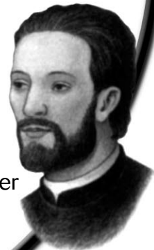
St. Peter Claver