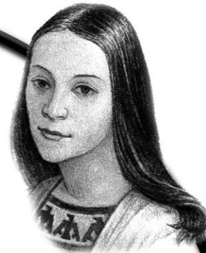
Bl. Kateri Tekakwitha