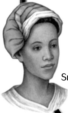
Sr. Thea Bowman